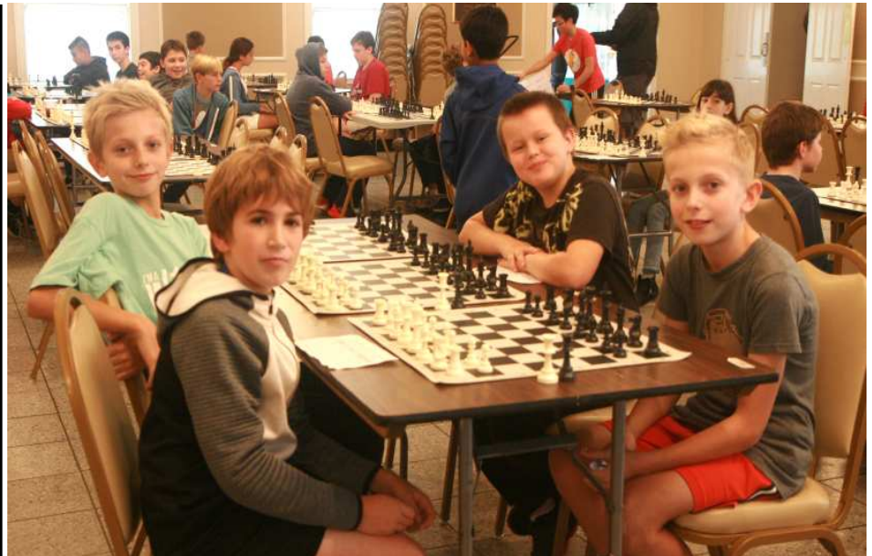
The Council's Fall 2019 Semi-Annual Scholastic Charity Chess Tournament was a great success. For details, see pages 6 and 7.