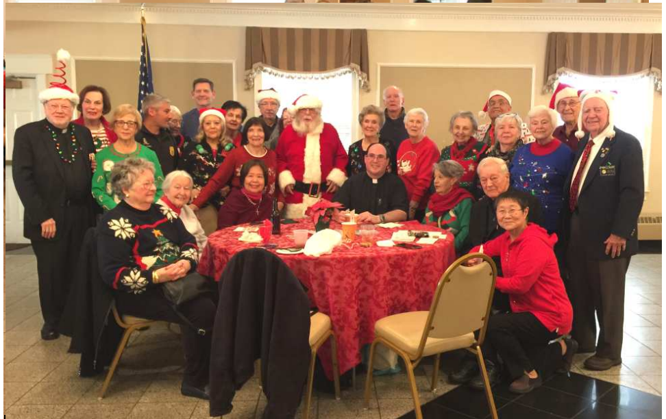
The Seniors had a great time at their annual Christmas Party. Santa paid a visit, while several folks donned his winter cap. For details, see page 9.