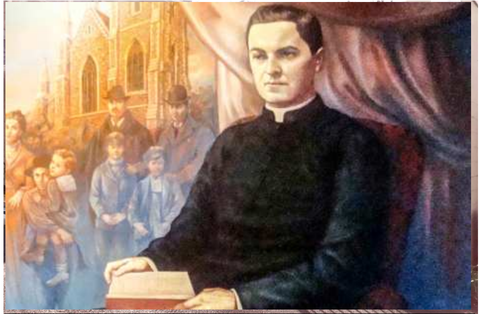
Fr. McGivney to be beatified. See pages 6 and 7.