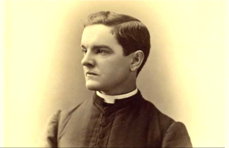
Fr. Michael J. McGivney will be beatified on October 31, most likely at St. Mary's Church in New Haven, Connecticut. See page 10 for further information.